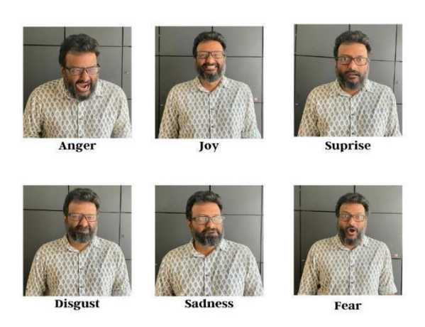
Figure 1 Title: Universal Emotions

Note: The above figure is an illustration of emotions that are universally accepted across the globe and were identified by Paul Eckman as six basic emotions that do not differ culturally in their meaning and acceptance.